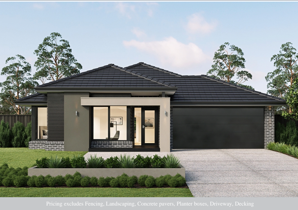
Pricing excludes Fencing, Landscaping, Concrete pavers, Planter boxes, Driveway, Decking